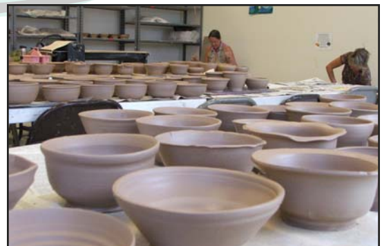
Bowls in process at the workshop at VBMA